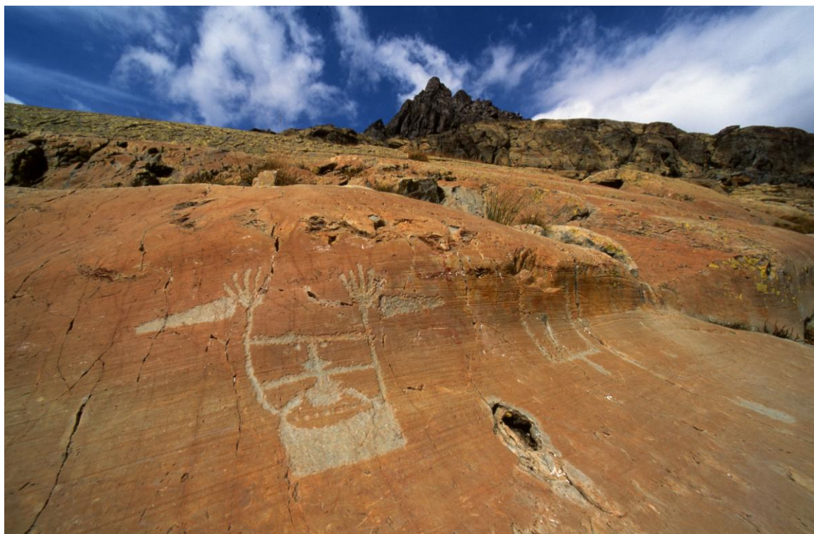
Engraved rock known as the "Wizard" in the Valley of Wonders (Tende, Alpes-Maritimes)

Duration : 5 days – Best time : May - June and September - October